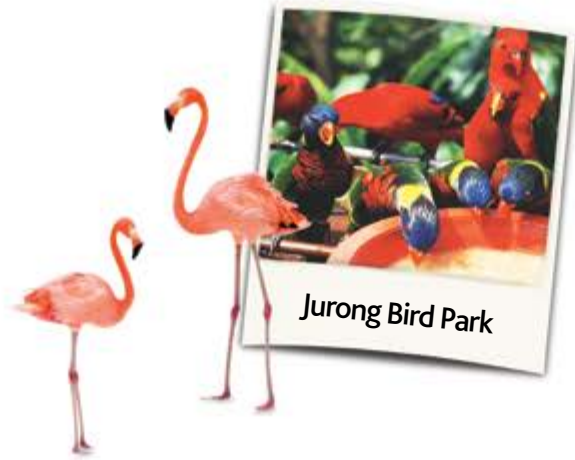
Jurong Bird Park