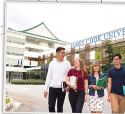
James Cook Univer